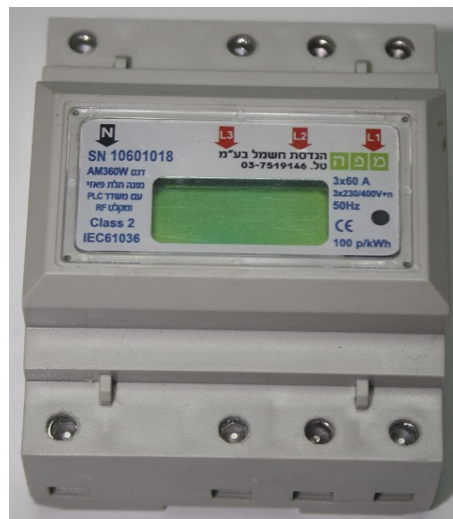
Fig.1. General view of RR303-F

Optional: RR303-F can be supplied with an internal radio receiver using unlicensed RF communication, that reads near by Water / Gas meters and introduces Water / Gas data into PLC media for concentrator to receive and report.