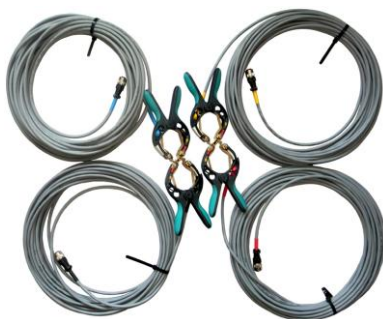
H winding test cable set