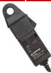
Current clamp 30 / 300 A