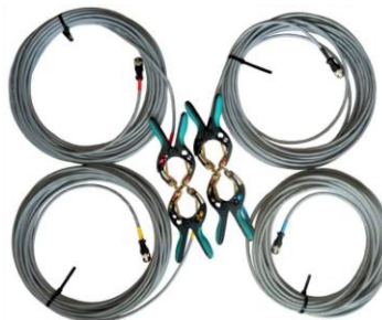
X winding test cable set