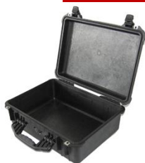
Cable plastic case